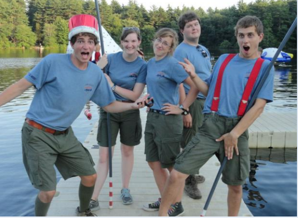
Have fun with friends!