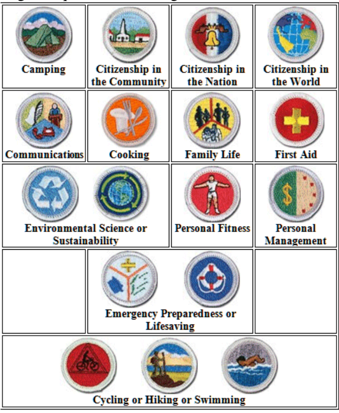
Eagle Required Merit Badges

Merit Badges are on a first come first serve basis and class sizes are limited. Sometimes a Merit Badge must be cancelled because the counselor can no longer teach. We will notify you if that occurs so you can choose an alternate badge.